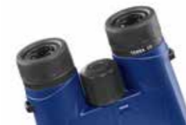
TERRA® ED 8×42 from ZEISS

The most exciting experiences can often be found in the tiniest details. The new TERRA® ED 42 from ZEISS puts these moments in focus – in excellent optical quality and extreme detail. The larger exit pupil guarantees a bright view even in difficult lighting conditions. A smooth yet precise focus knob ensures you will get on the subject quickly and clearly. In other words, it is a true all-rounder and the ideal companion for anyone not willing to accept compromises.