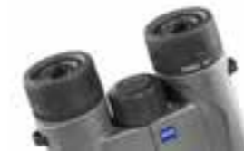
TERRA® ED 8×32 from ZEISS

Special moments are usually encountered when we least expect them. This is when the TERRA® ED 32 from ZEISS guarantees razor-sharp images – even when the subjects change position quickly thanks to the precise focus mechanism. With its compact size and low weight (just 510 g), it fits well in your hands and is the perfect companion for great adventures in nature.