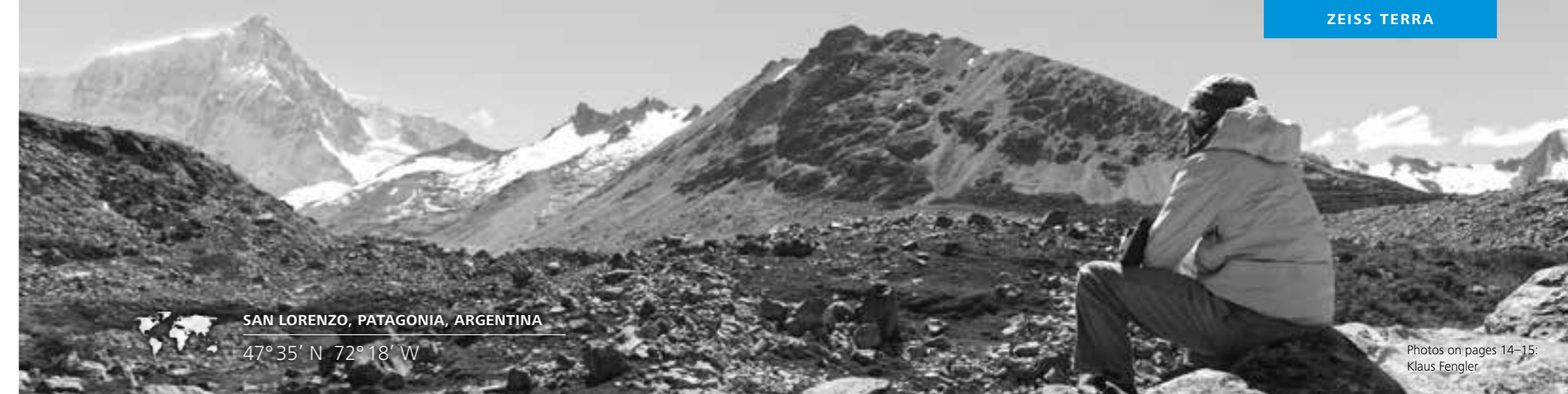
SAN LORENZO, PATAGONIA, ARGENTINA